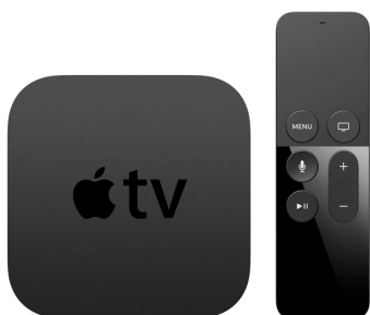
Models MLNC2, MGY52 Introduced September 9, 2015